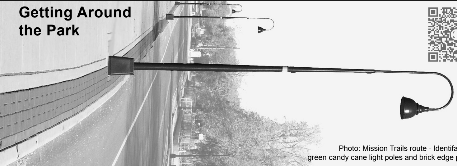
Photo: Mission Trails route - Identifiable by green candy cane light poles and brick edge paving